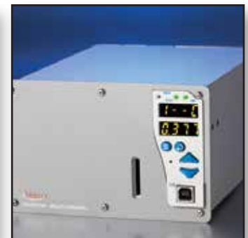
Piezocon Multi-Sensor Controller

Find out more at www.veeco.com or call 1.888.24.VEECO