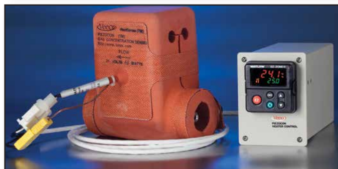
Piezocon Heater Jacket and Heater Controller