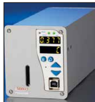
Piezocon Single Sensor Controller

The Piezocon system generates log data files with information such as vapor carrier gas concentration, precursor delivery rate, and MFC set-point, allowing optimization of the delivery system and identification of any malfunction, such as issues with the bubbler temperature or pressure, MFCs, pressure controllers, etc.